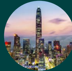
CPHI & PMEC Shenzhen