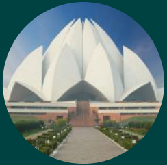
CPHI & PMEC India

CPHI has a packed calendar of events across the globe, uniting the best minds in pharma for face-to-face connections. Whatever your sector or region, we are your gateway to the heart of Pharma!