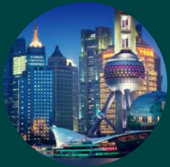
CPHI & PMEC China