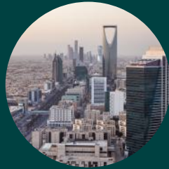
CPHI Middle East