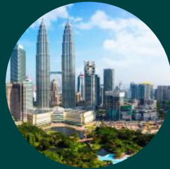
CPHI South East Asia